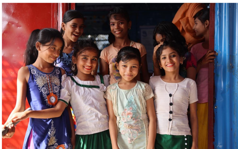
Adolescent girls are learning girl shine curriculum at one of the A&Y centers inside the camp