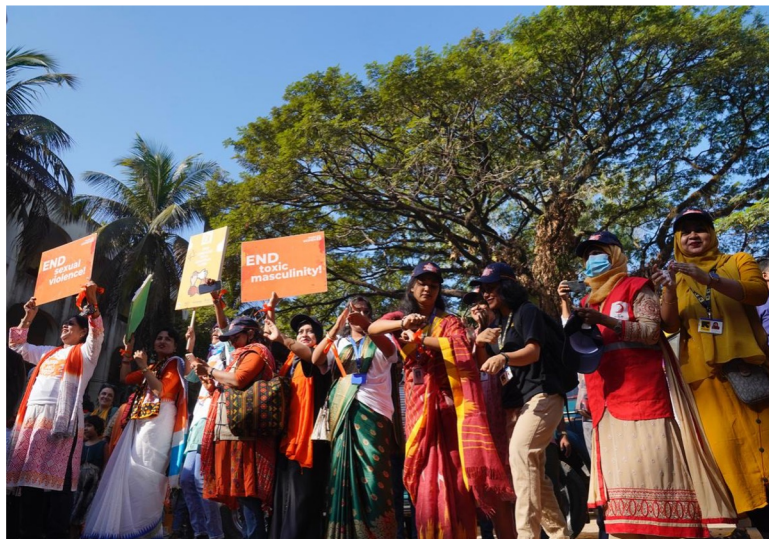
The launch of the 16 Days of Activism rally in Cox's Bazar