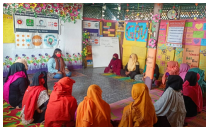
A session on GBV awareness at one of our WFS/Shanti Khana/UNFPA Bangladesh