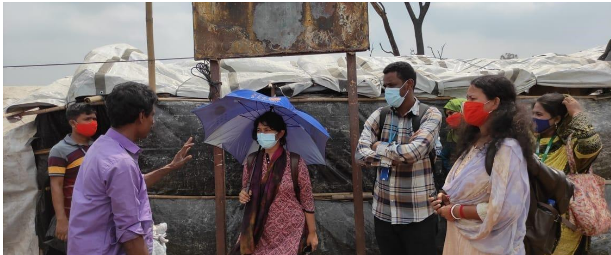
UNFPA discussing with community activists on emerging GBV risks in Camp 8E