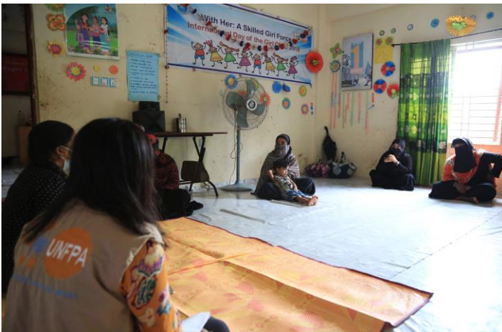
Focus Group discussions in Women Friendly Spaces on GBV response services / UNFPA Bangladesh