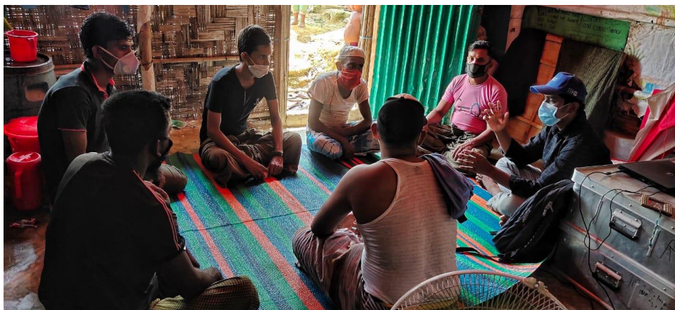
Community consultation on COVID-19 risk communication, SRHR and GBV