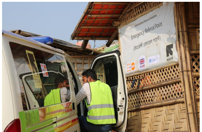
Emergency referral hubs allow provision of health services for emergency obstetric and new-born care