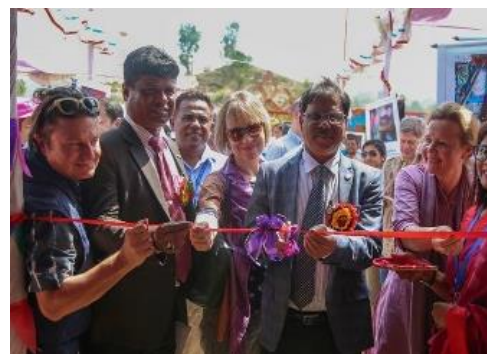
WLCC inauguration ceremony